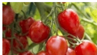
Tomato 'Fantastico' F1

All-America Selections (AAS) judges have finished a rigorous year of trialing and recently announced the newest AAS Winners.