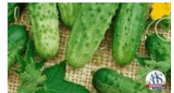
Cucumber 'Pick a Bushel' F1