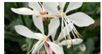
Gaura 'Sparkle White'