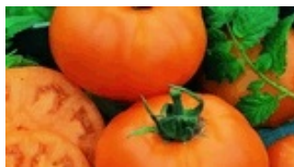
Tomato 'Chef's Choice Orange' F1