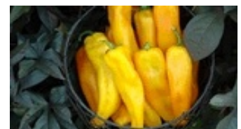
Pepper 'Mama Mia Giallo' F1