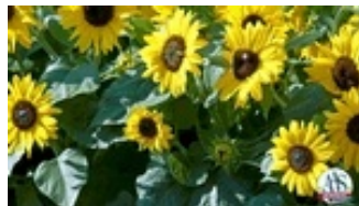
Sunflower 'Suntastic' F1