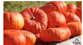
Pumpkin 'Cinderella's Carriage' F1

Read more about the traits of these exciting new introductions at the All-America Selection website, www.all-americanselections.org .