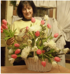
Grab the first bunch of tulips, and arrange

Happy new 'Blue' year. 2014 was initiated with a host of positive events. Regions closed last year with many special moments filled with ideas that go beyond regular programs. There were gals with denim purses, a member filled her green and white OAGC anniversary mug with the morning coffee, and one region even used its silent auction profits to fatten the Mohican raffle. A region reported that it actually pays for one person to attend Exhibitors' and Judges' School. In region 4, we sang together songs that celebrate our human bond with Mother Earth. Region 5 took time to share the ambition of a club's charter member, a 99-year old. There were junior bird houses and floral designs at several regionals. The response to the trip to Ireland was extremely positive.