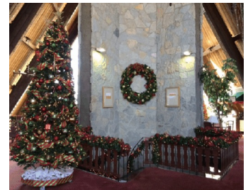
Hueston Woods Lodge 12' tree and 6' wreath

My husband Bill and I toured the Hueston Woods State Park Lodge a few years ago while camping. I took pictures then and the lodge décor was very 'blah.' When we arrived mid-November to help Regions 3 and 4 decorate the lodge for the holidays, the decorations were much