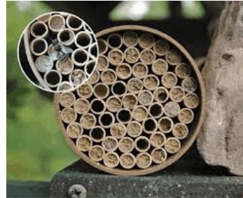
Hang a Mason bee structure

Attracting the Mason bees and inviting them to build a home in your landscape or near your garden will benefit both the bees and definitely your plants.